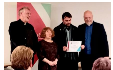
Fundraising for my ARCO Diploma