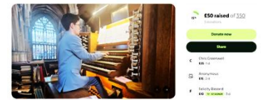
Unleash the Power of Music